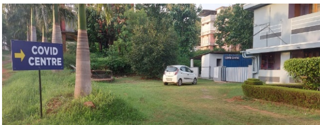
COVID CENTRE SET UP - (COVID BLOCK)