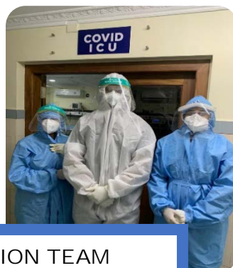
COVID - RAPID ACTION TEAM