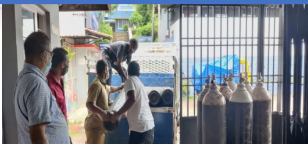
SHORTAGE OF OXYGEN CYLINDERS