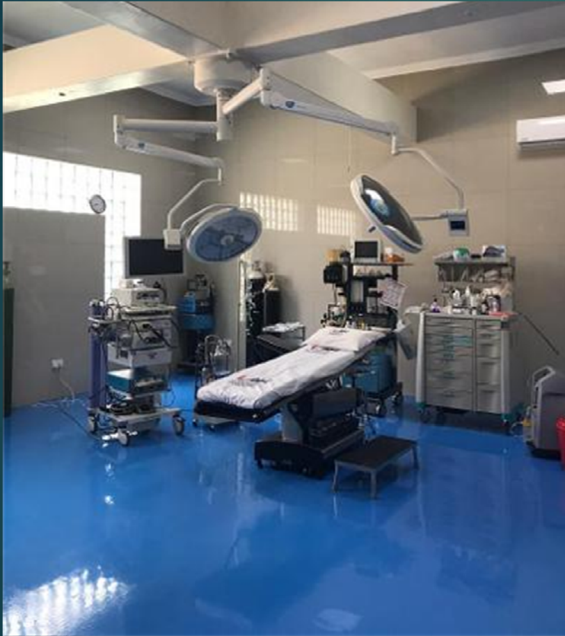
Operating Theatre 1