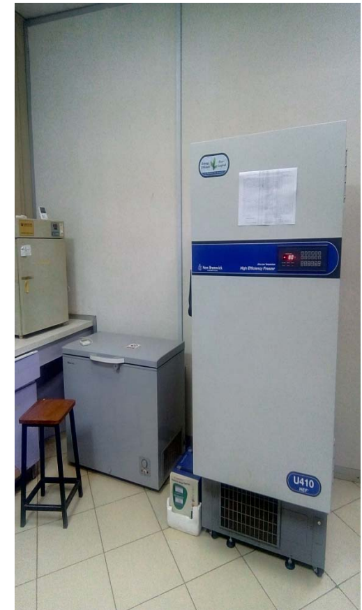
High efficiency freezer