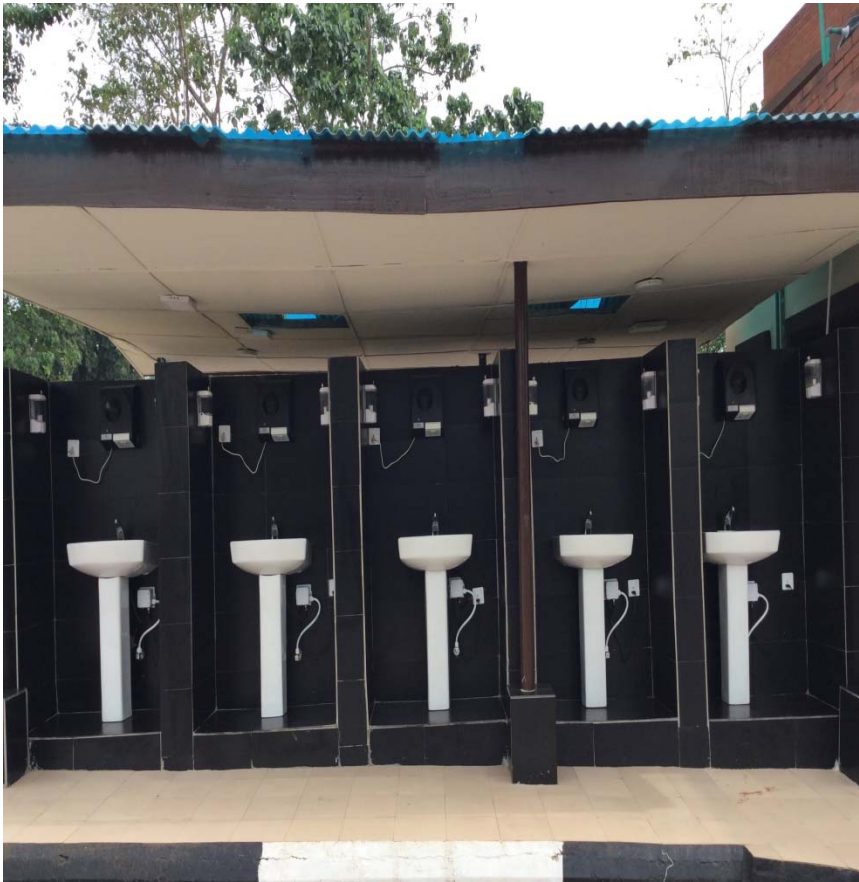
BU main gate