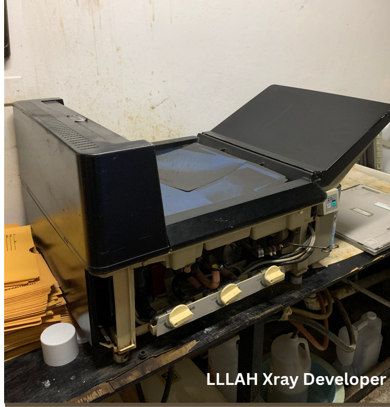
LLLAH Xray Developer

A very generous donation was able to cover the cost of a portable digital X-ray machine from Giving Tree Medical. If any medical missionaries are reading this and you need an X-ray machine like this, I would be happy to connect you with Giving Tree. They are a Christ-centered organization dedicated to sourcing medical equipment that strikes a good balance between quality and cost and can withstand the above-average wear-and-tear often experienced at mission hospitals. One of the amazing things about this X-ray machine setup is that we were able to take it back to Belize with us on the plane, so we were able to save on shipping costs and time. By God's grace, we are not required to pay duty on it, but we still had to pay taxes, which were quite substantial and something we had not budgeted for. But while I was on my way to pick up the X-ray machine from the GHI office, I received a notification from another friend who said he and his wife had just made a donation to us that covered a bulk of the taxes we needed to pay! This was actually their second time donating to us while we were in Belize. Their other gift helped cover the bulk of a costly tractor repair that is essential for keeping our expansive hospital grounds looking beautiful. Yet another blessing came from Loma Linda University Health (LLUH).